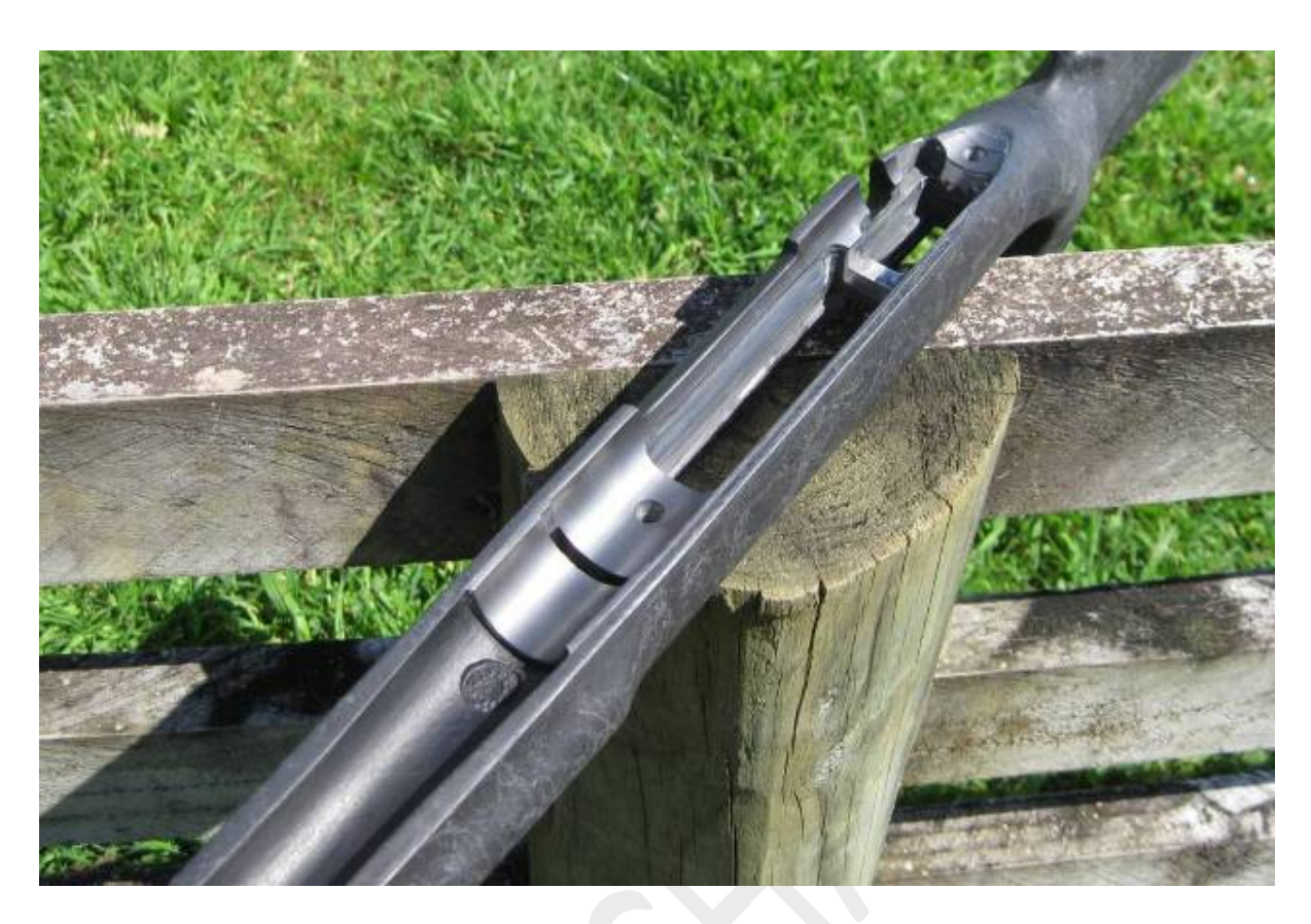
The HS stock, bedded with our MatchGrade steel based bedding compound.

The Accuracy International chassis is problematic. For those not familiar with this system, owning an Accuracy International stock system immediately gives the shooter the mystical qualities of being ready for arctic warfare. Don't believe me? Good. The AI is very basically a V block chassis. It is most common to use round actions in this V block so the actual contact area between the action and chassis is poor. Many times I have also come across poor recoil lug fit. The AI is difficult to bed because it does not really have side walls, having detachable plastic panels instead. The fix is to epoxy the action to the stock using a syringe type 5 minute epoxy. A release agent is applied to the action, the action is epoxied to the stock, resulting in what I call a rigid mount system, rather than a traditional bedding system which allows the barreled action to recoil and return to battery. Rigid mounting should not be confused with tightly fitted bedded. Tight bedding jobs result in pinched, double grouping rifles.