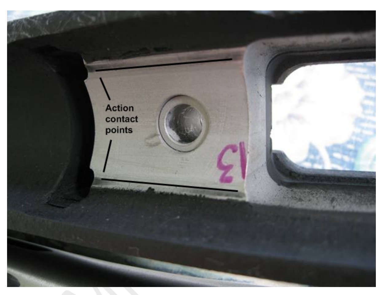
The excellent HS Precision fiberglass stock (M700 Sendero) showing the aluminum chassis and limited points of contact (note rub marks).

as small as .3MOA. But as cartridge power is increased, accuracy wanes. A rifle capable of shooting .25 to .3 MOA is handicapped, producing 1 MOA. The magic minute is not so magical when one considers that this translates into a 10.5" group at 1000 yards. Add to this a truly finicky bore producing an ES (extreme velocity spread) of 20fps from shot to shot and you're out to 15" at 1000 yards. Add human error from being away from the sand bags and bench, errors in reading wind and thermals and all of a sudden you're out to a 20" group at the very least.