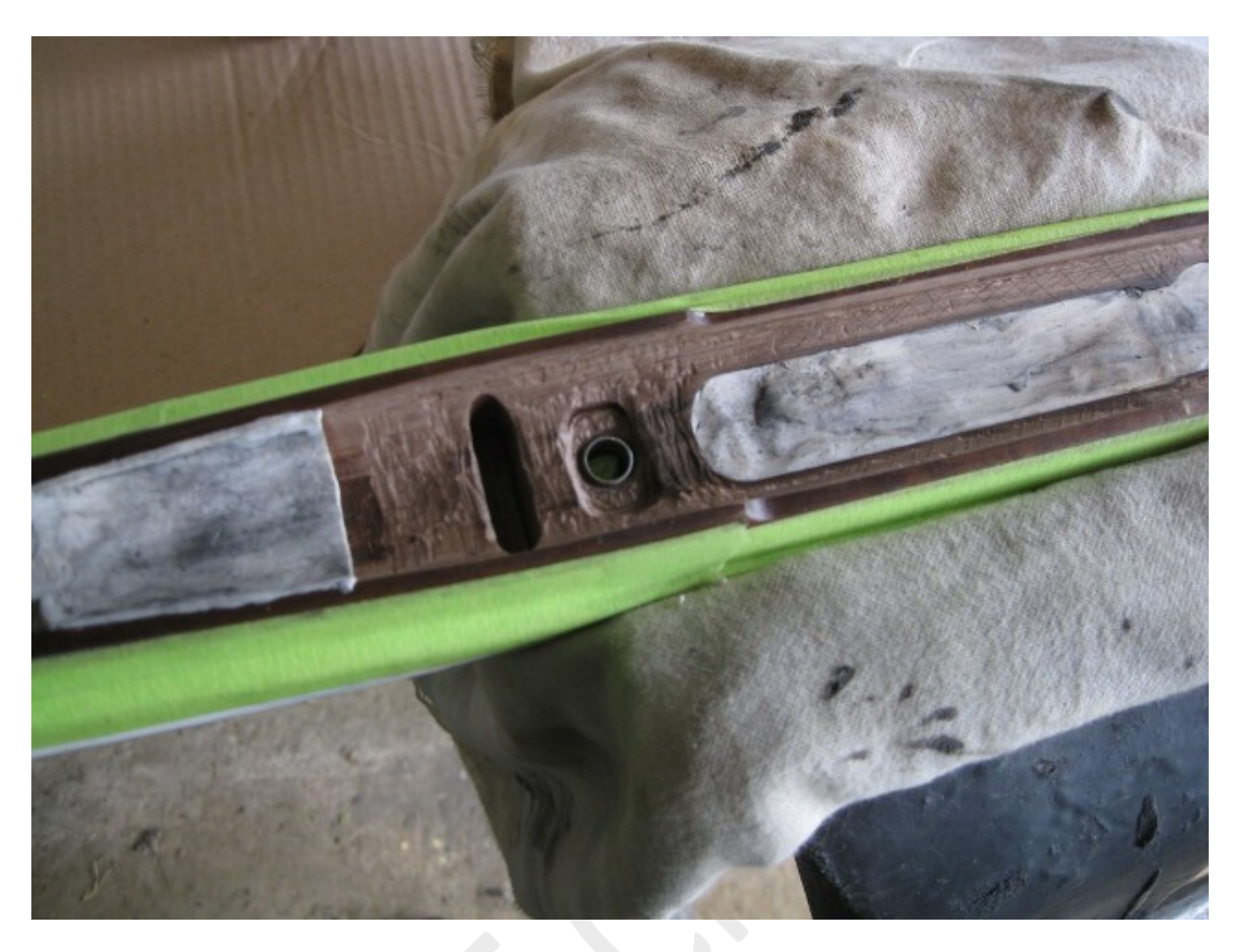
Tikka rifle stock showing front steel pillar inserted during the bedding process. Heavy walled aluminum pillars (wide diameter) are also common.

Pillar bedding is extremely important when dealing with wood stocks, the steel tubing is used to prevent eventual compression of the wood fibers at the areas of the action screws (king screws). Without pillar bedding, once compression occurs, it can lead to split stocks- and this is not a rare occurrence. That said, as I type this, on the work bench beside me sits a CZ rifle in .223 caliber. The front action screw hole in the wooden stock is located within a hair's breadth of the magazine well. If I were to drill the front king screw hole in the stock to fit a steel pillar, the stock would be weakened, the pillar proving counterproductive. In this case, a hefty bedding job will be an acceptable fix.