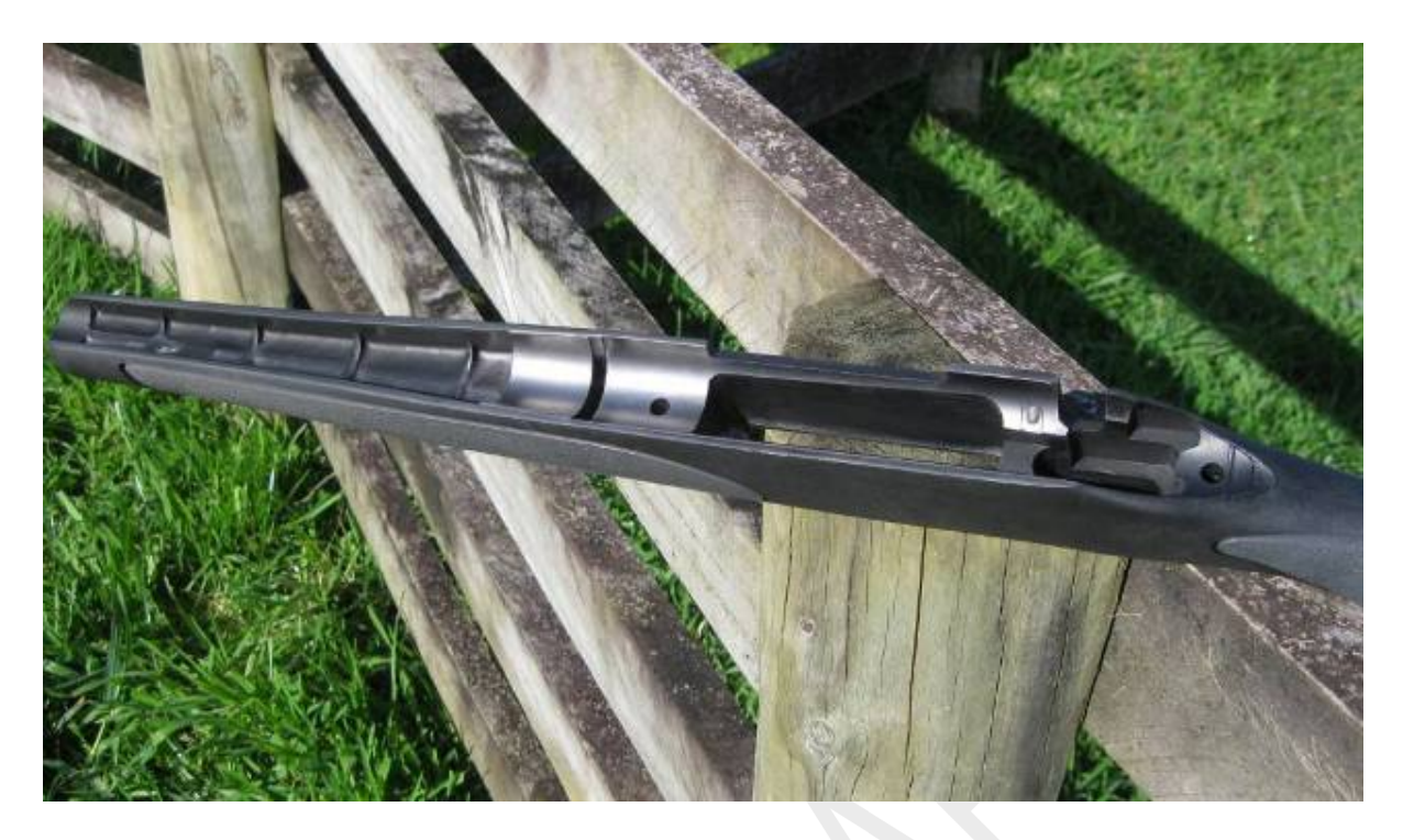
A bedded and stabilized Remington SPS plastic stock.

When bedding or stabilizing plastic stocks, a key factor is to use a hot knife to burn the stock internals, releasing oils and creating mechanical locks. With proper stock preparation, along with a thick, hefty bedding job, plastic stocks can produce a lifetime of reliable service. We need to exercise some common sense here though, opening up an SPS mountain rifle stock to accept a varmint contour barrel can re-introduce flexing. Another poor practice is fitting full barrel length over barrel suppressors which have become popular in the UK and NZ to plastic stocks- or any rifle for that matter. A quarter inch thick forend that flops around and touches this ridiculous suppressor design with varying pressures depending on shooting positions is a recipe for accuracy disaster.