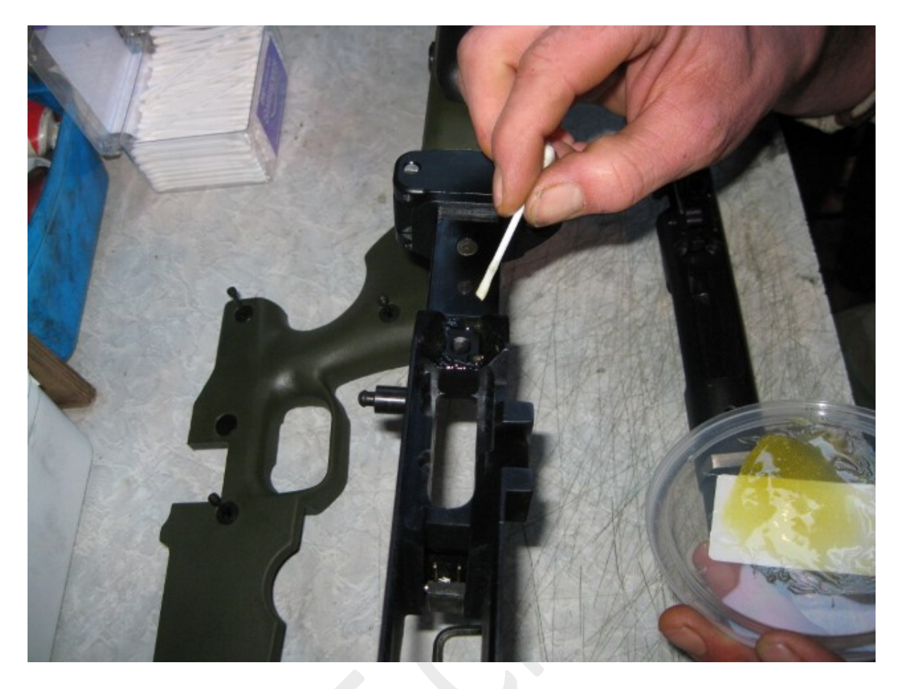
An Accuracy International stock, plastic panels removed. In this photo, I am applying a basic two pot (double syringe) epoxy to the V block at the tang prior to rigid mounting

Plastic stocks are extremely common now and while plastic is not necessarily the weakest stock material available, it is the most flexible. Flexing under recoil or with changes in forend pressure can greatly hinder accuracy. Several years ago, I designed an epoxy resin to fill the forends and action voids of plastic stocks for optimum rigidity. I call it a stock stabilizer compound. It is expected that the customer will then use our metal filled bedding compound to bed the rifle as is my recommended practice with all stocks. A resin filled, fully reinforced, bedded plastic stock can work very well for hunters on a limited budget. The stabilizer costs around U.S $15, for a family man on a single income, it's a lot cheaper than a replacement stock and can turn for example, an M700 varmint rifle into a truly reliable tack driver that is ergonomically sound into the bargain.